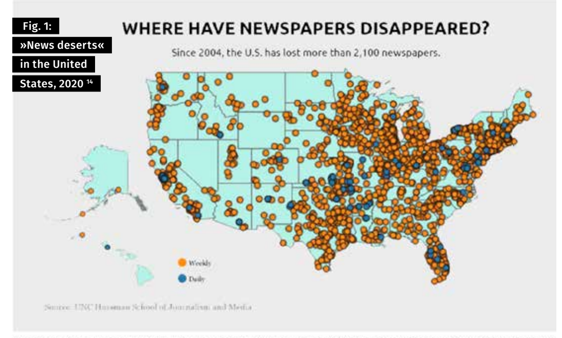
A map that displays communities where newspapers have disappeared (UNC Hussman School of Journalism and Media)

Most other publishers, however, are still working on answering the question of what kind of content will turn free readers into paying customers in the long term.